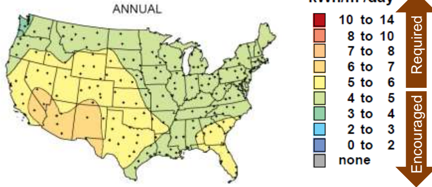
Average Daily Solar Radiation Per Month